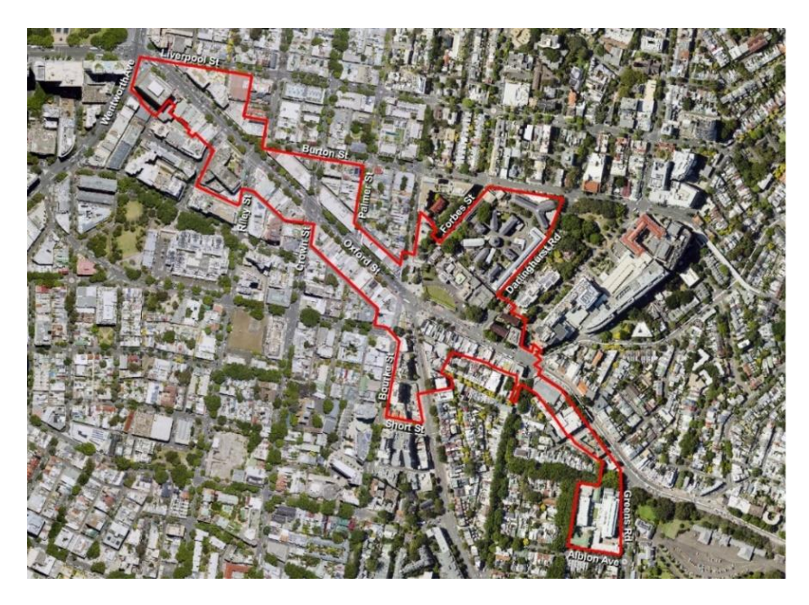
Figure 1 the boundaries of the Oxford Street cultural and creative precinct